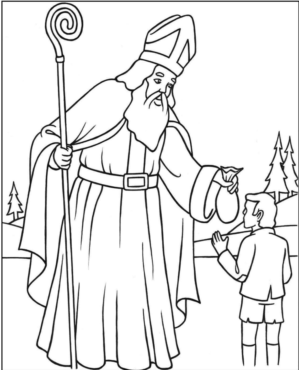
St. Nicholas